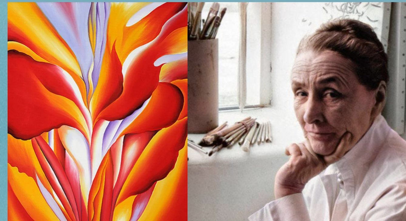
Georgia O'Keeffe - modern art painter

The international Ballet Academy & Theater wants to recognize, honor and celebrate the dancers, & families from the Irish community for sharing and contributing to our enrichment through their legacies and the values that have always bound Ireland and the United States together