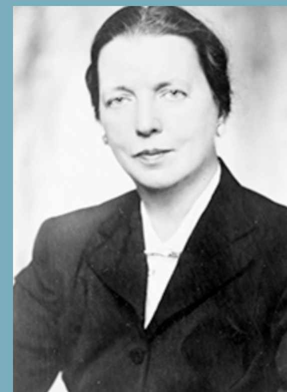
Irish-American Laureate Poet

Perhaps this very instant is your time Louise Bogan