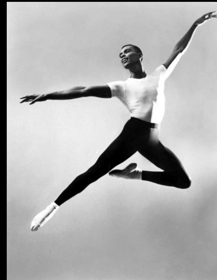
Arthur Mitchell (March 27, 1934 – September 19, 2018) was an American ballet dancer, choreographer, and founder and director of ballet companies. In 1955, he was the first African-American dancer with the New York City Ballet, where he was promoted to principal dancer the following year and danced in major roles until 1966.